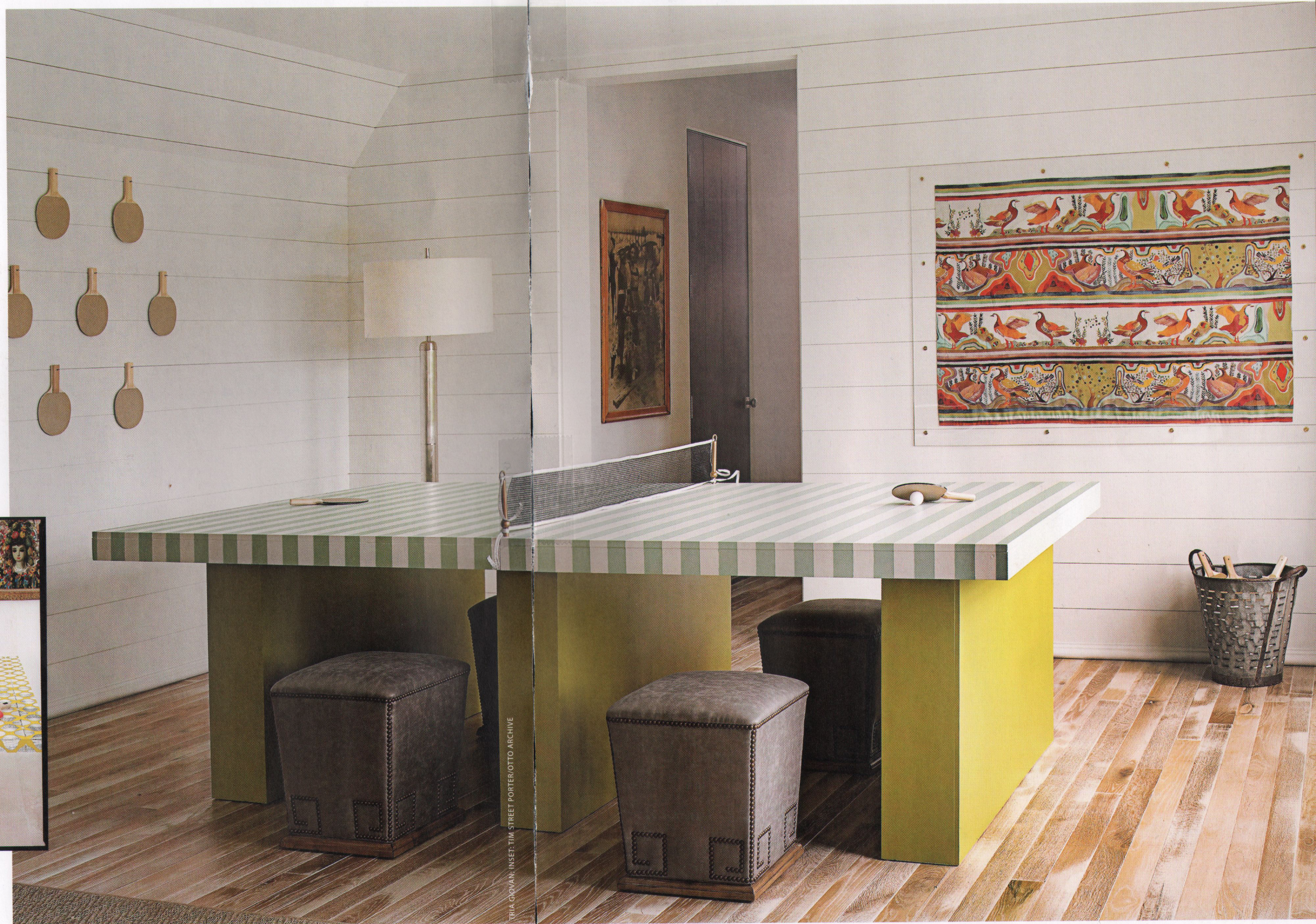
TRIA GIOVANI, INSET: TIM STREET PORTER/OTTO ARCHIVE